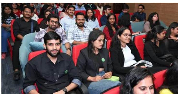
Alumni enjoying their time at the Meet

Approximately 170 plus alumni attended the event, representing various batches and departments.